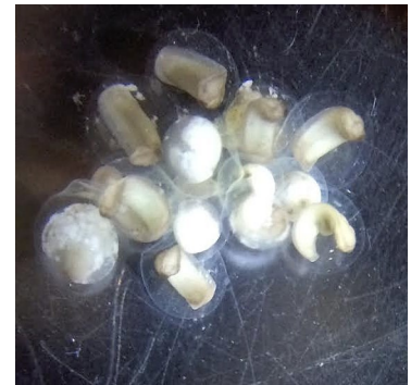
Developing frogs, 1 day prior to emerging from eggs as tadpoles.