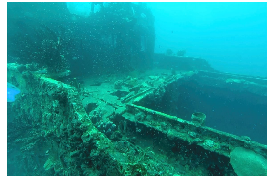
Wreck of Lesleen M.